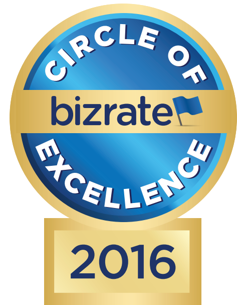
The 2016 Bizrate Circle of Excellence award looks like this

To include the Bizrate Circle of Excellence award in other collateral across a variety of media, we also provide you with high resolution files for: Web, Print, and Grayscale. Please choose the appropriate forms based on the medium you choose for the best results.